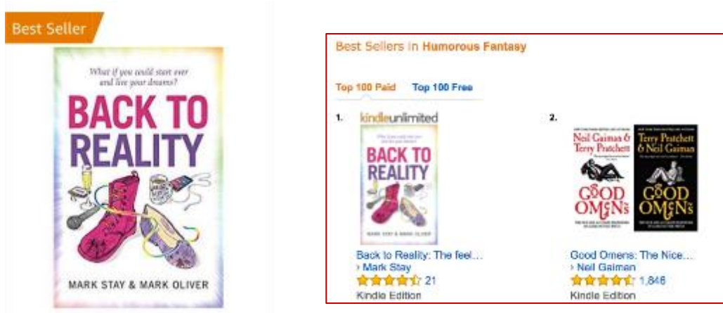
Screen grabs from Amazon as at 17/10/2017